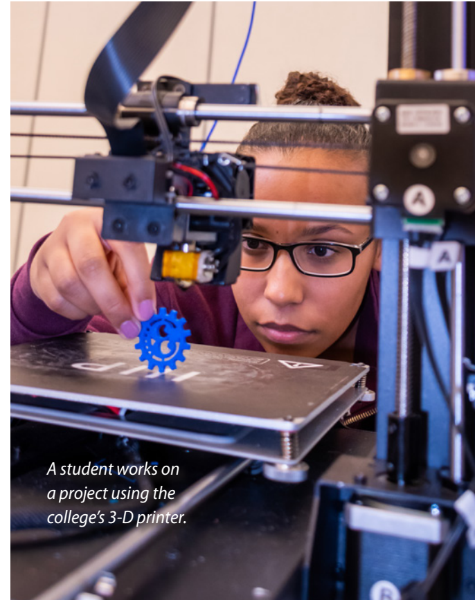
A student works on a project using the college's 3-D printer.

Eight 3-D printers were purchased through MAD grant funding. Printing classes were made available to the public in which 10 community members were served. We were also able to offer a Design & 3-D Printing camp. The 3-D Printers were used as they would be in industry, with students using Solidworks and Tynker CAD software to design and print their creations. The middle school camp was full with 10 participants and the elementary camp had seven. Through these camps, we introduced campers to industry skills and related jobs. MCC also participates with Discover Manufacturing tours throughout the county. In order to help campers connect the camp concepts and industry careers, we combined the camps with an on-site tour at Greenville Tool & Die (GTD). GTD had 10 employees work with our campers in small groups to discuss design through production in an industry setting, which aligned to the campers designing and 3-D printing. The pilot was extremely successful. We are seeking funding to support transportation for similar camps next year. We want to allow children to experience real work for an improved career exploration.